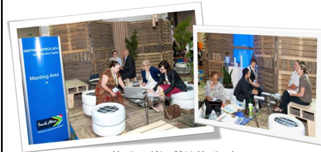
Meetings Africa 2014: Meeting Area