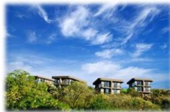
Thabo Eco Hotel

Accommodation establishments make heavy demands on natural resources and create large waste on a daily basis.